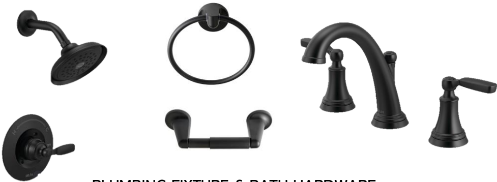
PLUMBING FIXTURE & BATH HARDWARE