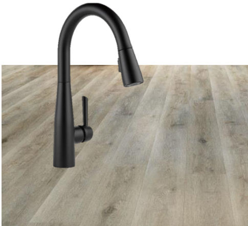
FLOORING & FAUCET