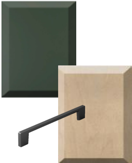
CABINETS & HARDWARE