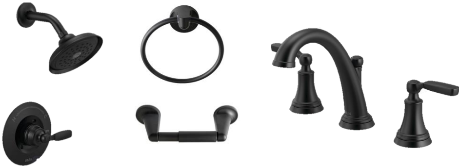
PLUMBING FIXTURE & BATH HARDWARE