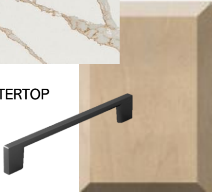
CABINETS & HARDWARE