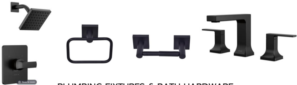
PLUMBING FIXTURES & BATH HARDWARE