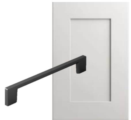
CABINETS & HARDWARE