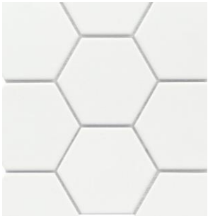
SHOWER FLOOR TILE