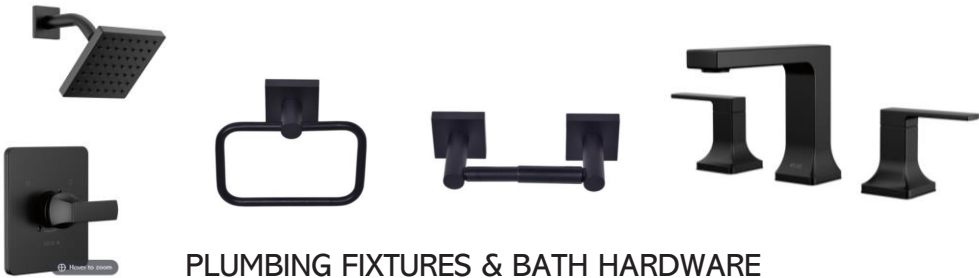
PLUMBING FIXTURES & BATH HARDWARE