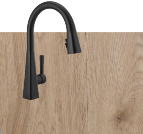
FLOORING & FAUCET