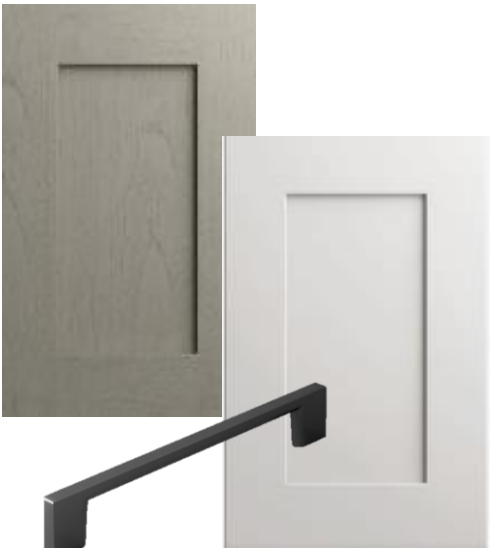
CABINETS & HARDWARE