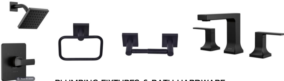
PLUMBING FIXTURES & BATH HARDWARE