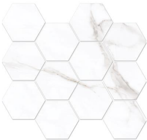
SHOWER FLOOR TILE