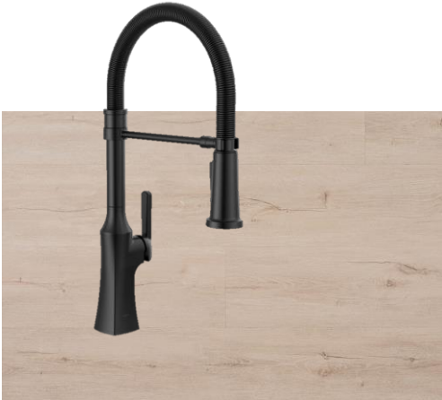
FLOORING & FAUCET