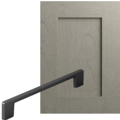
CABINETS & HARDWARE