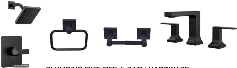
PLUMBING FIXTURES & BATH HARDWARE