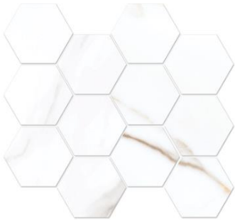
SHOWER FLOOR TILE