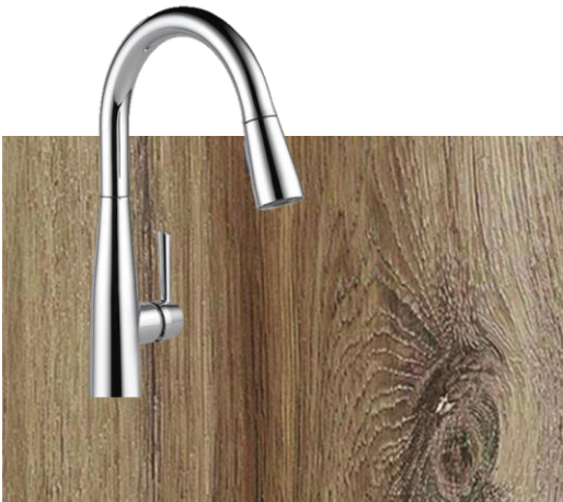
FLOORING & FAUCET