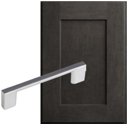
CABINETS & HARDWARE