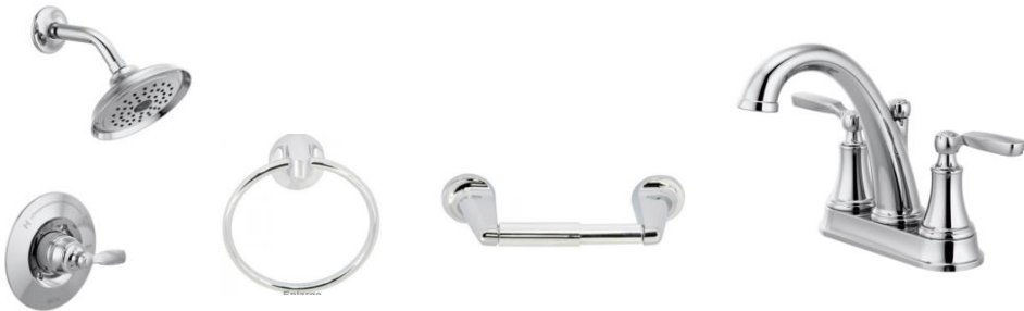
PLUMBING FIXTURES & BATH HARDWARE