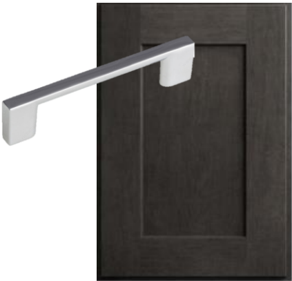
CABINETS & HARDWARE