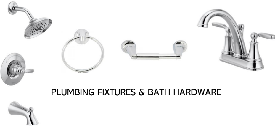
PLUMBING FIXTURES & BATH HARDWARE