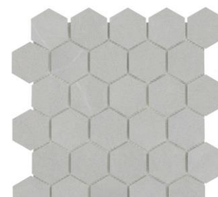
SHOWER FLOOR TILE