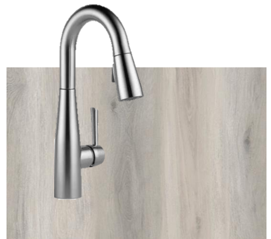
FLOORING & FAUCET