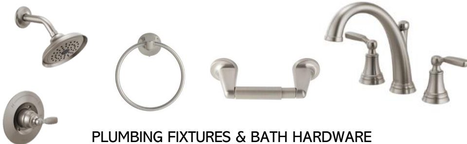
PLUMBING FIXTURES & BATH HARDWARE