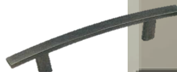
CABINETS & HARDWARE